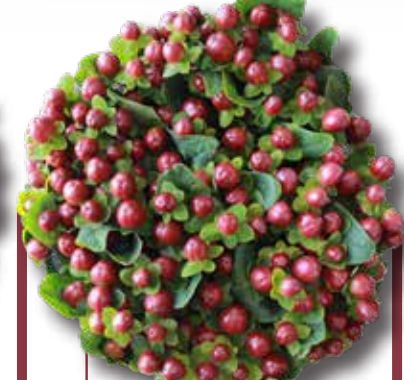
Hyp Magical Royal Princess (Colour pink, available all year round)